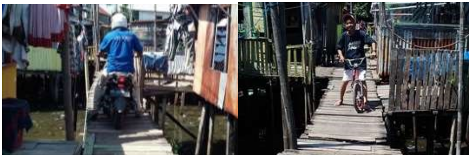
Figure 9. Motorcycles and bicycles using the titian.

Here is a figure of the titian that has undergone the development into a concrete bridge in the settlement on the water Bajoe bone district, and housing on the water in Pontianak. Titian has been developed into a wider concrete road/bridge that can be traversed by cars and motor vehicles, connecting residential areas with urban centres, in addition to improving the circulation of human beings as well as the circulation of goods and services. Use of reiling on both sides of the catwalk for the security of the user of the titian