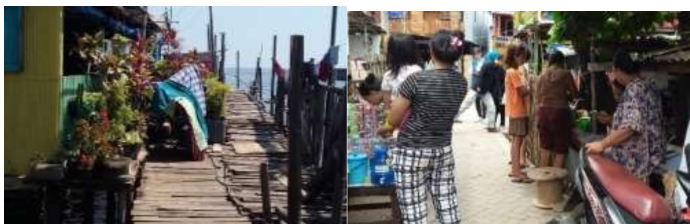
Figure 5. Functions of the titan as a motorcycle parking and social and economic interaction.