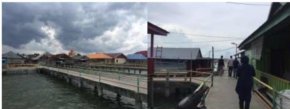
Figure 10. Development of titian in Kampung Bajo. Bone-Sul-Sel.