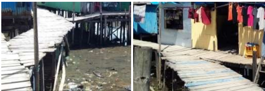
Figure 3. Marbor Titian is wider (1.5 m) and has branches/intersections.