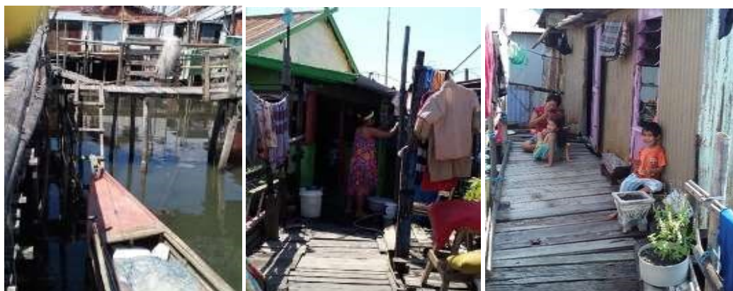
Figure 7. The function of the titan as a place to wash and bathe the child.