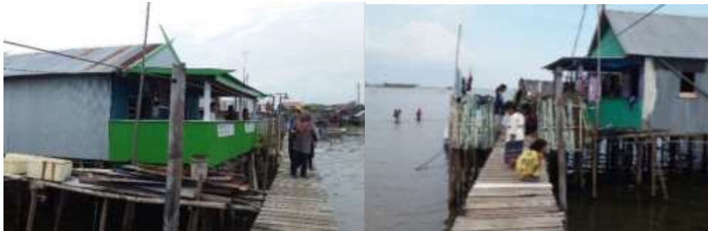
Figure 4. The function of Titan as pedestrian and play for children.