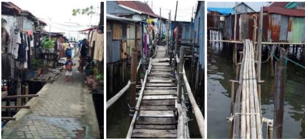
Figure 2. Street dimension in Karabba and Marbor kampong.