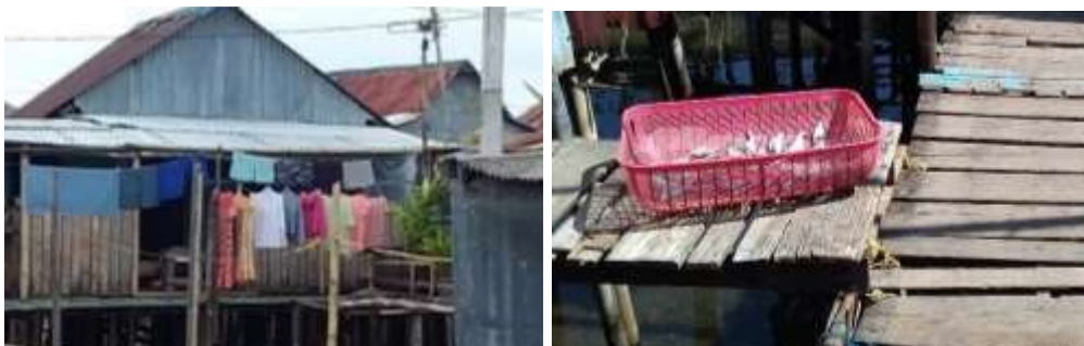
Figure 6. The function of the titan as clothes and fish clothesline.