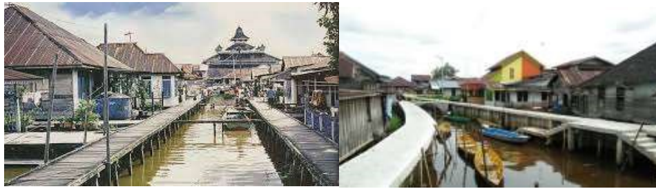
Figure 10. Kampung Beting Pontianak.

Titian in Kampung Beting Pontianak has been developed, so it is stronger and not easily decayed as before. The size though not according to the standard size of the path (2m) but has been traversed by two-wheeled vehicles from the opposite direction. The caution of road users is still needed because there is no railing on the path of the bridge.