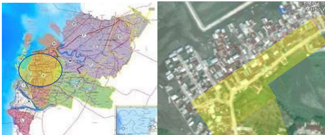
Figure 1. Study location. Kampung of Karabba and Marbor (District Tallo, sub-district Buloa) The yellow colour is the mainland area with concrete roads, while the other is the shallow water area affected by tidal seawater.

The study takes place on the informal settlement area of the Karabba and Marbor coastal Housing sub-district of Buloa, District of Tallo.